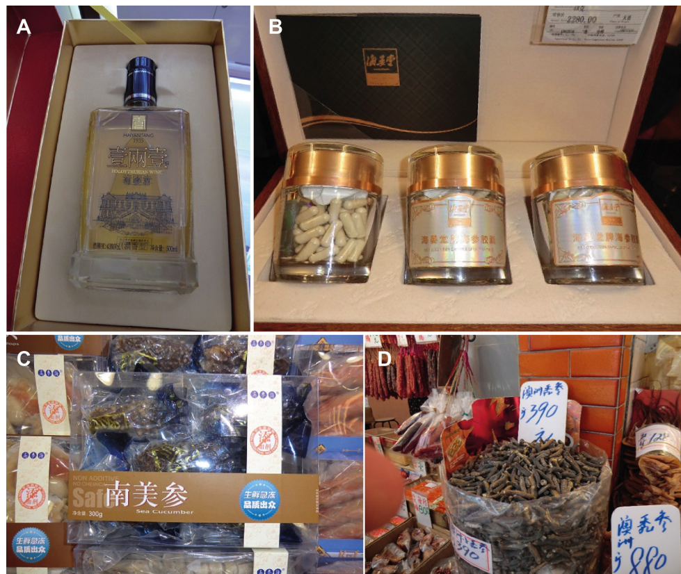
FIGURE 2 | Holothurian wine (A); capsules with contents of sea cucumbers (B); frozen sea cucumber from a supermarket (C); “Australian bald” sea cucumbers sold in Hong Kong (D).

(Figure 2C). Some sea cucumbers have labels asserting they are “non-additive” and “chemical free” “to assure consumers that no additives have been used to artificially increase the reconstitution ratio of the product” (Purcell et al., 2014a, p. 49). One Beijing-based trader described the potential for “green” labeling that focused not on environmental sustainability of the production, but on food safety: “in the past nobody asked about these things, but more and more people do now.”