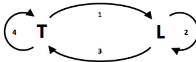
Figure 1: A simplified version of Laurillard's (2002) Conversational Framework

Two areas of educational research and development underpin this project: Diana Laurillard's (2002) influential conversational framework, and the field of learning design. Broadly speaking, the conversational framework proposes that the interaction, dialogue and feedback between teachers and students are critical to students' learning processes and outcomes. A simplified version of the framework is presented in Figure 1. A generalised learning interaction begins (1) when a teacher [T] designs and presents material or an activity to learners [L] who then engage with this by acting upon it (2). Learners subsequently respond to the material or activity given their current understanding (3), often directly to a teacher. This is then reflected and acted upon by the teacher (4) before a new loop or cycle is initiated in which the teacher may choose to re-present the material or activity, remediate or provide learners with feedback.