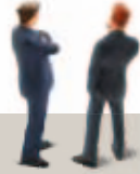
FIGURE 1: Factors Influencing Occurrence and Extent of Channel-Based Price Differentiation