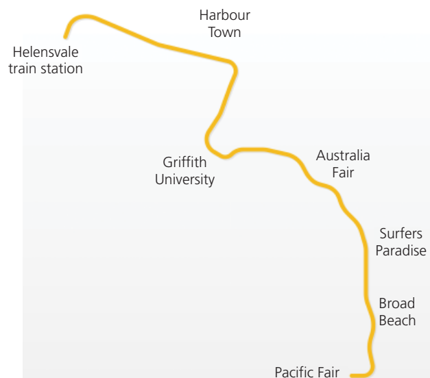
Figure 1. Route of bus line 709

As shown in Figure 1, bus line 709 in Queensland connects Helensvale train station to Pacific Fair by way of Broad Beach,