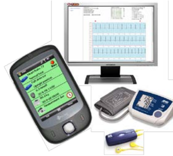
Fig. 2. Personal Health Monitor

At Twente the emphasis has always been on telemedicine, ie. using “extraBAN” communication between the patient BAN and a remote healthcare organisation or clinician. A generic architecture for Body Area Networks (BANs) and a supporting m-health service platform have been developed, referred to respectively as the MobiHealth BAN and MobiHealth MSP. Based on the generic architecture, a series of specialised BANs and software applications have been developed for different patient groups from a number of specialties including cardiology. Biosignals measured by body worn sensors are transmitted to a remote healthcare location where they can be viewed by clinicians. Automated or clinician-initiated feedback and treatment completes the (macro) loop for BAN-based m-health services. Since 2002 several telemonitoring and teleretreatment applications for a variety of (chronic and acute) clinical conditions have been trialled on different patient groups over the course of a number of collaborative projects (IST MobiHealth, IST XMotion, eTEN HealthService24, Freeband Awareness, eTEN Myotel).