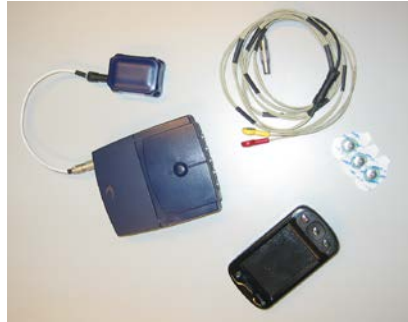
Fig. 1. One variant of the MobiHealth BAN