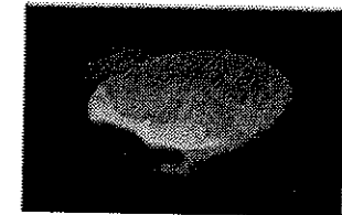
Figure 1 (left) and Figure 2 (right) – Hold: Vessel 1 (2001) Lynette Wallworth. Appeared in ACMI exhibitions World Without End (2005) and Deep Space: Sensation and Immersion (2002)

Here, Paul is reflecting upon his interaction with Lynette Wallworth's Hold: Vessel 1 (see Figures 1 and 2 above), included in an exhibition entitled World Without End, at the Australian Centre for the Moving Image (ACMI) in 2005. This installation was incredibly popular with ACMI's visitors, drawing strong responses in relation to its evocative and experiential qualities. The visitor's encounter with Hold commences with