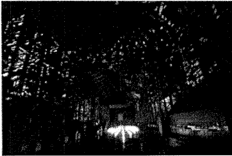
Figure 1. Part II of an installation in the Turbine Hall on Cockatoo Island, by the Responsive Environment art group in collaboration with local artists

to become aware of the complexity and grandness of the structure through the installation. This was addressed using the most simple, cheap and sustainable methods that could achieve the greatest result. Firstly, we chose to break the viewing of the installation into two parts: by daylight and by dark. In both parts, the entire floor of the hall (1000m 2 +) was covered with a shallow layer of water, such that the 25m high structures of the space could also be seen in the mirror reflection, creating a spatial experience of effectively 50m in height. In the night viewing, a fragmented animation was projected from behind the structural walls of one side of the hall, with the effect of complicating and confounding the already spatially complex architectural forms. The entire ceiling of the hall became a virtual spider web of moving structures. While this projection was not responding to human movement in the space, it sufficiently engaged the perceptual and contextual systems of the viewer to produce a highly immersive experience.