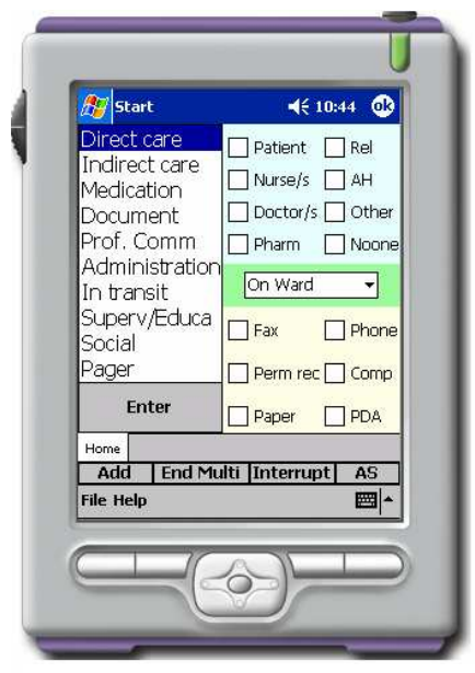
been prepared and those developed for nurses<sup>10</sup>, doctors<sup>11</sup> and pharmacists<sup>12</sup> work have been detailed elsewhere.

the task and what information resource, if any, is used. Mutually exclusive definitions of each work task have