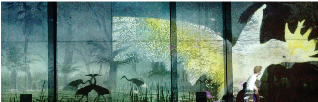
Figure 3. Photographic particle clouds emerge from movement in Creature:Interactions .

The free-form motion tracking, physical simulations, and attraction systems allow a complex but understandable response to movement. The warping of totem creatures, revealing of photographic animals, flocking of birds, throwing of moons, and floating of stars give the audience a range of interaction aesthetics that can be explored through full-bodied, free-form interaction.