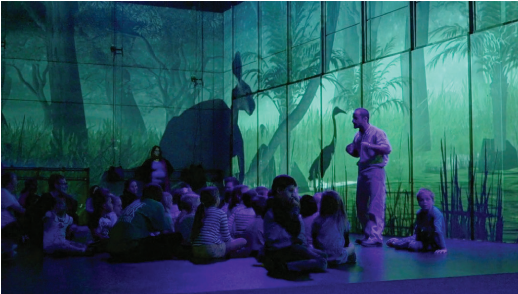
Figure 5. Facilitator briefs the children inside the large 360° Creature:Interactions playspace at the Queensland Performing Arts Centre.