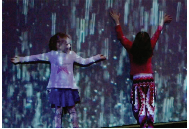
Figure 6. Children playing in digital rain.

Many members of the audience remarked upon the impressive illusion of the 3D butterflies during this section and were observed discussing the butterflies long after the experience had finished. On two separate occasions, participants have described physically feeling the butterflies touching the ends of their fingers as they appeared to land on their outstretched hands. This phantom touch sensation is yet another example of the brain activating unengaged senses within the immersive digital environment.