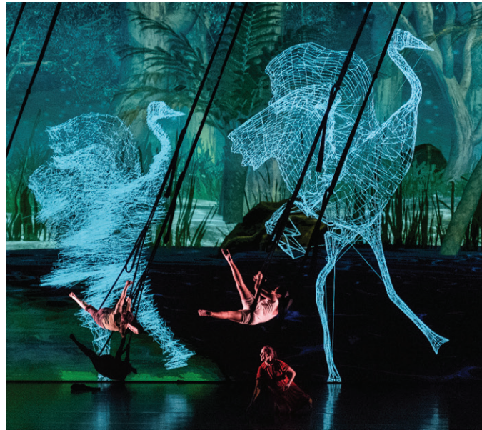
Figure 2. Performers flying through the air on slings in the companion theater show, Creature:Dot and the Kangaroo . (© Stalker Theatre. Photo: Darren Thomas.)

Creature:Interactions installation and its associated physical theater show, Creature:Dot and the Kangaroo . Physical theater artists often explore a wide range of movement including handstands, somersaults, and backflips, often using equipment such as stilts, catapults, and trapeze-like slings at great heights (Figure 2). To capture this wide range of free-form movement, a robust infrared motion-tracking system was developed using optical flow algorithms on a network of cameras. The system picks up any movement and allows the artwork to be used by individuals or crowds. Free from any prescribed movement, the participants have been observed waving, jumping, dancing, kicking, cartwheeling, and performing free-form tai chi as they explore their embodied relationship with the surreal virtual world.