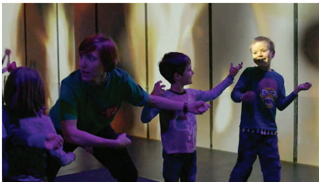
Figure 4. A facilitator working in a group to extinguish the virtual bush fire in Creature:Interactions , 2015. (© Stalker Theatre. Video still: Jaina Kalifa.)

In a social mixed-reality environment, the way humans relate with the digital is only half of the story. The participants have a shared experience as they explore the digital environment and often form small groups to throw moon balls at each other or warp the creatures in unique ways. Live facilitators engage with children to suggest different forms of movement as they interact with the system and each other. The facilitators suggest the children “move like a creature from the Australian bush” to expand their palette of movement beyond simple hand-waving. The children hop like kangaroos, flap their arms like kookaburra, jump like frogs, and slither like snakes, which changes the interaction aesthetic and allows them to further connect with the virtual bush environment.