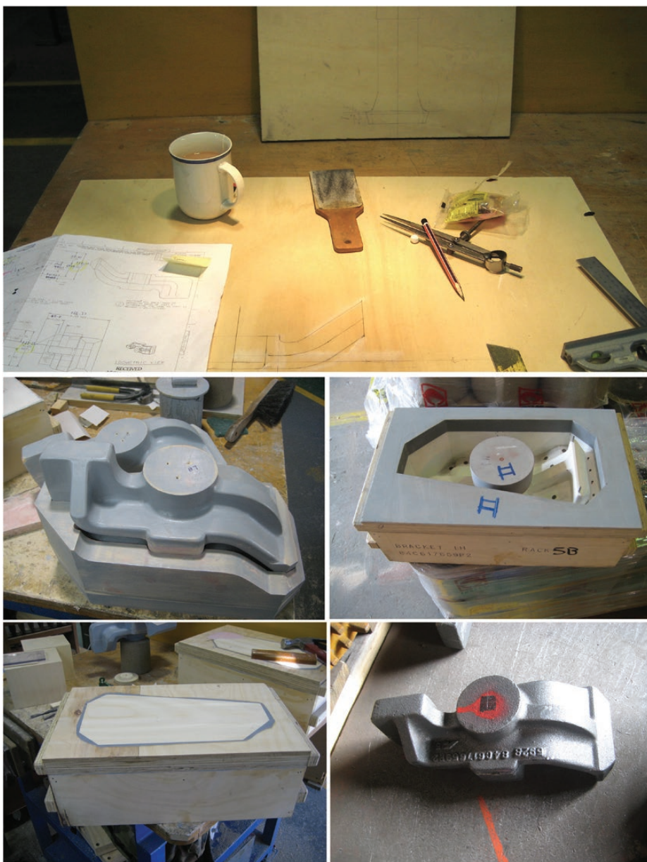
Fig 6. Patternmaking process for a brake strut, including layout, pattern, corebox and casting, 2009. Pattern and photographs by Tim Wighton, reproduced with permission.

understand form, geometry, light and visibility in a similar way to a designer. In my interview with Schuckar, she even used the same terminology, ‘language’, as Cross: