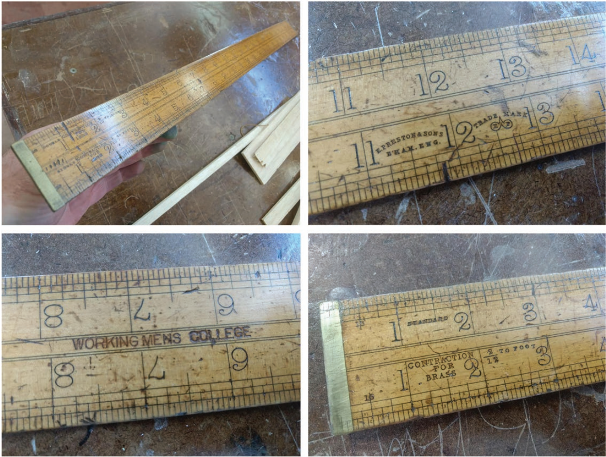
Fig 7. E. Preston & Sons, brass contraction rule.

alongside designing the core box, plate and cores. 77 Murrells described patternmaking prior to CNC: