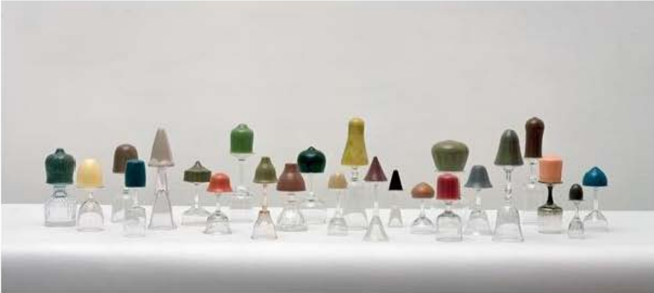
Figure 1. Hany Armanious, Untitled Snake Oil , 1998, hotmelt, glass, 24 pieces, dimensions variable. Image courtesy of the artist and Roslyn Oxley9 Gallery, Sydney.

Oil (1998) won him the prestigious Moët & Chandon Art Prize. In this work, an assortment of nineteen champagne, wine, port, and sherry glasses were displayed upturned on a table. Using a vinyl material called hot melt, he cast the space inside of the glasses to create colored forms which he placed on top of each of the corresponding vessels that sat on the table. The effect of fashioning a magical altar from household items was mesmerizing (fig. 1).