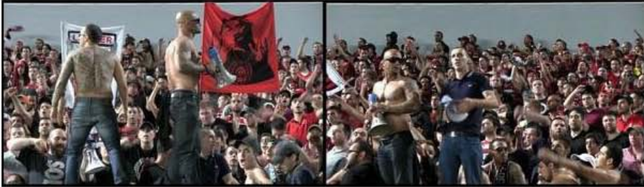
Figure 9. Khaled Sabsabi, Wonderland , 2014. 2 Channel HD Video.

sound carries a distant screaming from the collective shouting of excited fans. The screaming in Sabsabi's video is haunting, and seeing bodies running en masse lends the association of something having gone awry. For example, it is possible to draw parallels between Sabsabi's scene and that of people frantically running from the Manchester Arena in the terror attacks at Ariana Grande's concert.