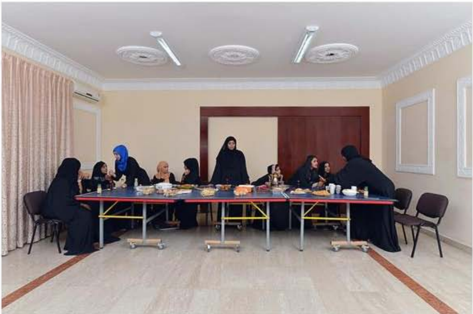
Figure 25. Fassih Keiso, The Last Supper Not (Why Not?) , 2016, digital c-type, 80x120cm.