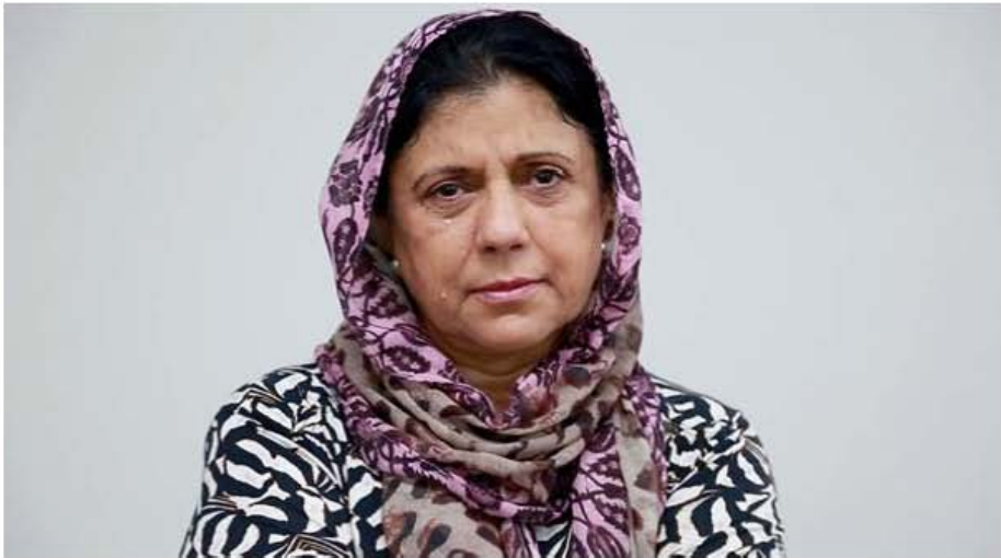
Figure 13. Joanne Saad, Remembering, Jamila , 2014. HD Video. Image courtesy of the artist.

This “closeness” is perhaps best demonstrated in the work Remembering (2014). Saad created a collection of sixty photographic and video portraits with residents of Blacktown in Western Sydney (fig. 13). The works portray various subjects conversing with the artist (who was offscreen), disclosing private stories full of hope, joy, and sadness. Many face the camera head-on and close up, making them appear incredibly vulnerable. Their stories are told willingly and one suspects they must trust Saad as the recipient of their recollections. The confessional style of this work is a haunting antithesis to the confessional videos that confront us in reality television. Rather than mocking her subjects, Saad portrays their humanity alongside her own, to reveal the emotional life of stories and memories that bring us closer together.