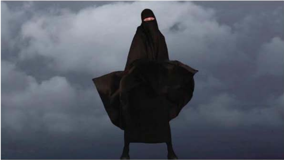
Figure 17. Cigdem Aydemir, Bombshell , 2013, IID Video.

assumptions between unveiled/liberated/beautiful and veiled/oppresed/object. 28