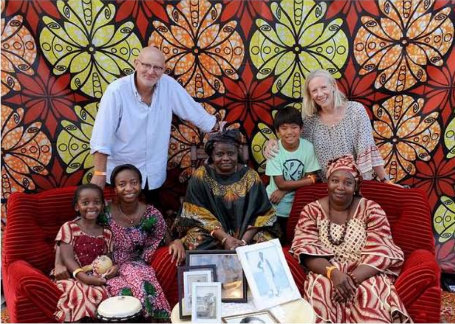
Figure 12. Joanne Saad, Family Portraits , 2015.

I am fortunate that I have met so many amazing people who have welcomed me into their homes and shared their personal stories. It is this experience that I wanted create for Bankstown: Live —bringing private worlds into the public space and connecting people with one another through intimate moments. 21