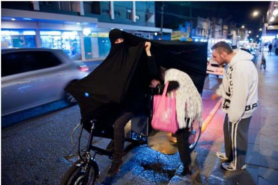
Figure 19. Cigdem Aydemir, Extreme Activity (ride) , 2011, HD Video.

Aydemir understands intimately the politics of veiling because she wore a hijab herself for ten years. As a result, her work successfully reveals the current paranoia associated with contemporary representations of Islam and the veiled woman. In response to fear and paranoia, Aydemir attempts to “demystify the other” by inviting her audiences to take part in her performances, welcoming them into her veil. 26 For example, in Extremist Activity (ride) (2011), she rode her bicycle around the city and invited people to climb under her veil-cum-carriage (fig. 19). The artist notes: “The Extremist Activity series was, in part, a response to the Islamophobic fear of Muslim women who could be hiding ‘anything’ under their veils, as well as a tongue-in-cheek look at the stereotype of Muslim extremeness.” 27