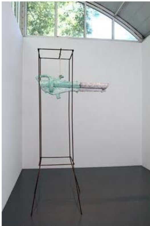
Figure 5. Hany Armanious, Le Nez , cast pigmented polyurethane resin, bronze, 245x118x51cm, 2010.

In another work from the biennale, Le Nez (2010), Armanious recalls Alberto Giacometti's 1947 work of the same title, except in his contemporary homage he has replaced Giacometti's infamous bronze nose with a reproduction of an iconic Australian garden tool—the leaf blower. Cast in pigmented polyurethane resin, it hangs uselessly suspended from a bronze frame (fig. 5), like a huge erect penis (or “fallic intrusion” as the artist has described it). 13 Both these works recall monumental sculpture and yet their main subjects—a paper crown, Ikea tables, and a garden leaf blower—remain determinedly un-heroic.