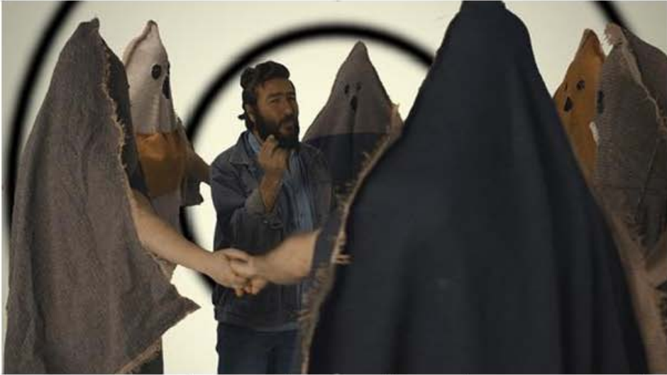
Figure 15. Hossein Ghaemi, Truth , 2014 (still), HD video.

gone awry (fig. 15). Their identities are often concealed under thick gold, silver, and black face paint.