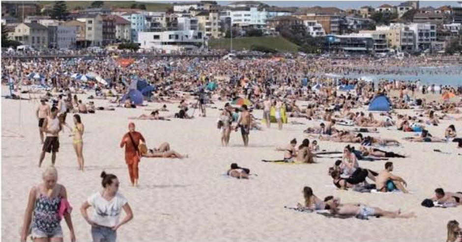
Figure 20. Cigdem Aydemir, I Won't Let You Out Of My Sight , 2015, IID Video.

(Cronulla Beach was the site of racial tensions between local Anglo gangs and young Lebanese men in 2001). 31 On her shoulder she carries what appears to be a life-saving device that doubles as a boom box blasting the theme music of Baywatch (fig. 20). 32