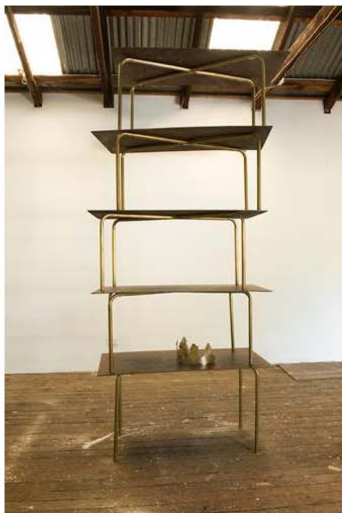
Figure 3. Hany Armanious. Adzeena Persius , 2010, bronze, gold plated silver, tourmaline, rubelite, blue topaz, garnets, citrine, 278x120x60cm. Image courtesy of the artist and Roslyn Oxley9 Gallery, Sydney. Photo: Greg Weight,

Significantly, Armanious's critical and commercial recognition reached a peak in 2011 when he represented Australia at the fifty-fourth Venice Biennale with a solo exhibition, The Golden Thread (2011), commissioned for the Australian Pavilion. Armanious is the first and only artist from the Middle Eastern diaspora to represent Australia since it began participating in 1954.