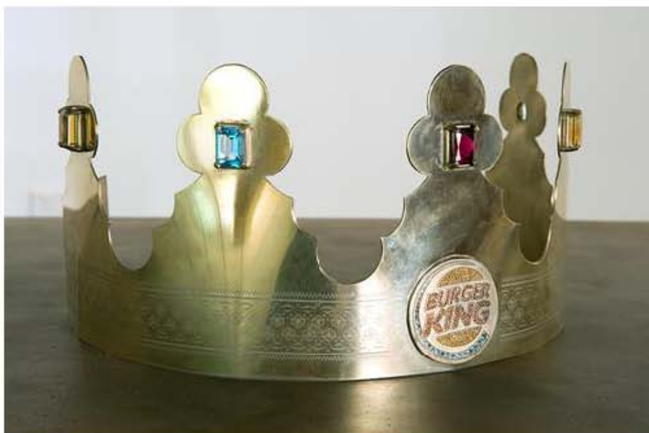
Figure 4. Hany Armanious, Adzeena Persius , 2010 (crown detail), bronze, gold plated silver, tourmaline, rubelite, blue topaz, garnets, citrine, 278x120x60cm.

For Venice, he drew on his long history of casting to reproduce and transform insignificant everyday objects into a peculiar assemblage. For example, Adzeena Persius (2010) provoked the viewer to form perplexing associations between materials, subjects, and objects (fig. 3). In this monumental work the artist stacked five bronze-cast Ikea tables on top of one another, erecting a perilous tower that forced the viewer to look up to a metaphorical heaven. Armanious's Ikea tables were transmuted from throwaway furniture into exquisite bronze. On the bottom table Armanious placed a replica of a paper crown sourced from the fast-food chain Burger King, reproduced in gold-plated silver and adorned with semi-precious stones (fig. 4). The crown was instantly familiar as an object I had received as a child, and yet in gold-plated silver and with colorful tourmaline, rubelite, blue topaz, garnet, and citrine gems it was transformed into a fairy-tale object. 13