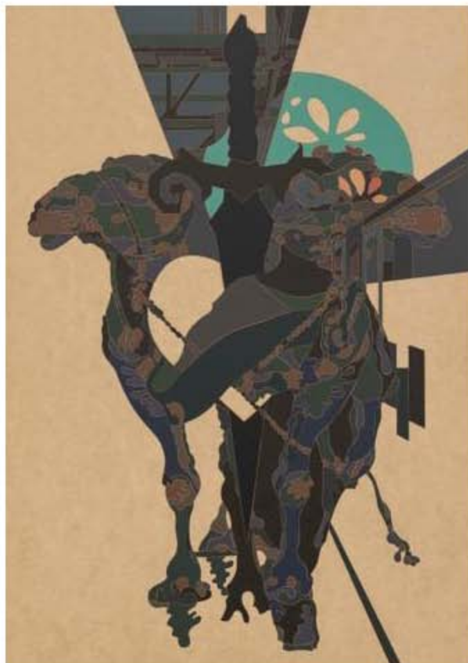
Figure 23. Raafat Ishak, 1977 , Acorn , 2017, oil on MDF, 81x59cm.

The artist also revealed that he uses disparate sources to collect his imagery. These include “department store catalogues, brutalist architecture, staircases, military insignias, children’s books, animal skeletons, to name a few.” 57 In a recent exhibition titled 1977 (2017), Ishak presented such imagery in a suite of nine paintings on MDF (fig. 23). In this series he left the MDF unprimed and its timber-colored background offers something like a sandy desert scene containing an array of subjects such as a camel, a big brown bear,