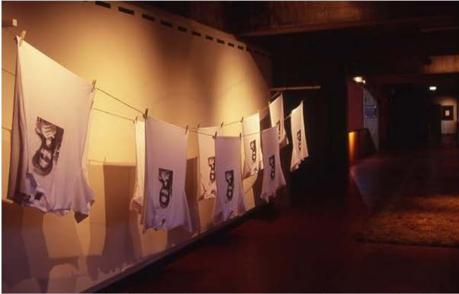
Figure 6. Khaled Sabsabi, Where we at , 2000. Audio, 20 printed t-shirts, wooden pegs, rope, wood and paint.

admonished for its perceived valorization of terror. In fact, the work's objectives were far more complex in its attempts to juxtapose two incongruous symbols—the Australian backyard and terrorism.