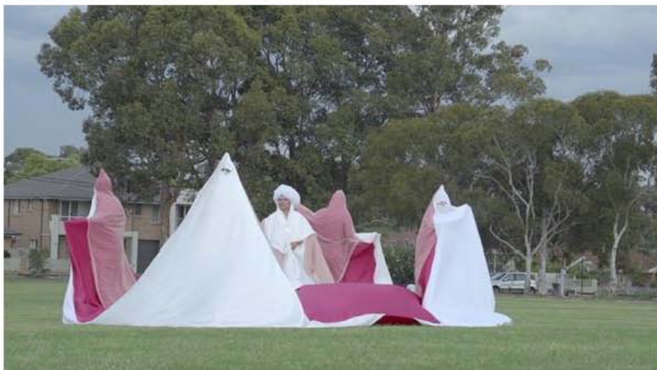
Figure 16. Hossein Ghaemi, Angry Flower , 2015 (still), HD video.

performance while sucking on a long drinking straw and battling the strength of a powerful wind.