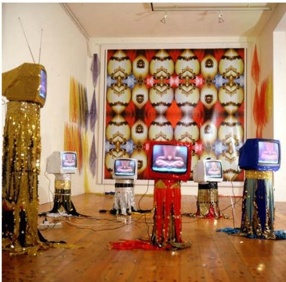
Figure 26. Fassih Keiso, They Shoot Belly Dancers, Don't They? , 1998, mixed media, installation view, variable dimension.

their two-fold struggle to guard their neighborhoods while simultaneously fighting for equality with the local male combatants. 45 The nature of this twofold struggle serves to define Keiso's practice as a whole. The artist sees his role as one that attempts to bring two divergent worlds together, the two worlds he himself inhabits. Despite various ideologies on the body, religion, culture, and war, Keiso's work seems to effortlessly and at times provocatively synthesize and picture incongruent mind-sets, objects, and people.