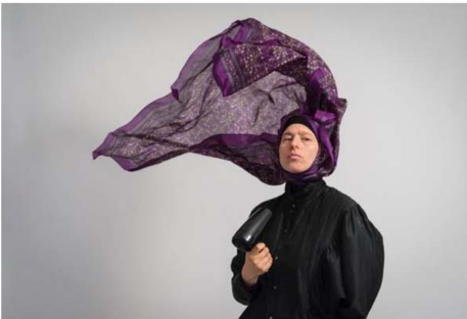
Figure 18. Cigdem Aydemir, Whirl , 2015, HD Video.