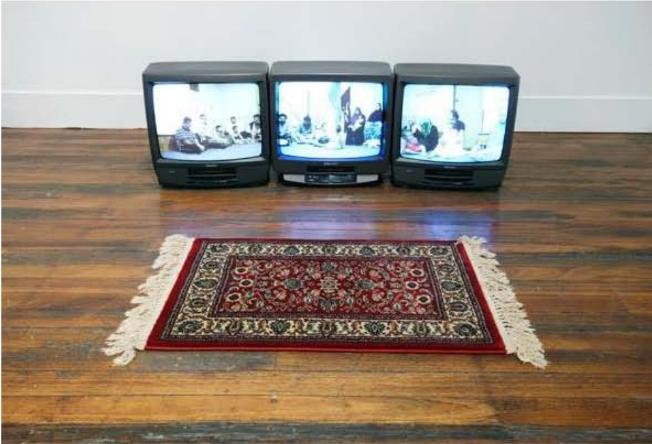
Figure 7. Khaled Sabsabi, Naqshbandi Greenacre Engagement , 2011. 3 Channel SD Video, paper, rug, plastic, wood and perfume. Image courtesy of the artist and Milani Gallery, Brisbane.

women chant in unison, children walk in and out of the scene, some climbing on their mothers, another baby asleep on its mother's shoulder, and others walking casually in and around the hall.