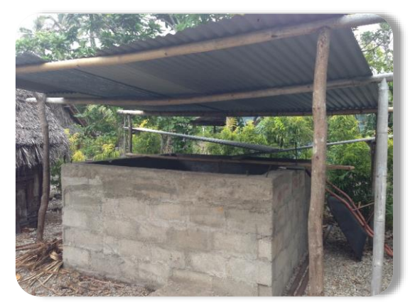
An underground rainwater storage tank ( lasitern ) built in-situ

Having access to multiple types of water sources in Uripiv gives flexibility to households for accessing water under different climatic conditions, but not all households can afford them. Households with rainwater harvesting systems use them during the rainy season when the wells are frequently contaminated by flooding, then switch to the wells in the dry season when rainwater tanks run empty. However, poorer households cannot afford domestic rainwater harvesting systems. Instead, they are either entirely dependent on the wells or need to ask permission from neighbours to use their rainwater. Having low access to a variety of water sources weakens the adaptive capacity of the poorer households to climate change.