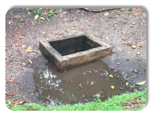
Pooling around wells in Uripiv is common during heavy rainfall

"Naoia em i kam olsem solti. Ating from draesisen tumas, afta mekem se i no gat inaf wota. Sola i stap pulum, be i kam solti."