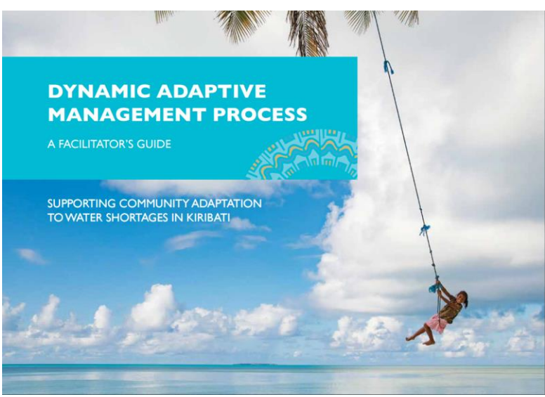
Facilitators guide to the dynamic adaptive management process https://www.uts.edu.au/sites/default/files/FacilitatorsGuideCommunityAdaptationKiribati.pdf

Resources on building resilience of rural water services to climate change through improved flexibility and empowerment are still under development. One way to build flexibility is to support communities to develop adaptive management plans that help them to make decisions about how to safely access water when climate hazards unexpectedly cause problems. The Dynamic Adaptive Management Process, developed in Kiribati but also useful in Vanuatu, is one such resource that helps in this regard: