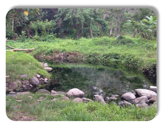
A secondary water source in Namoru community protected by thick vegetation

Women are the primary managers of water at a household level in Namoru, but they have limited influence on decision-making about how the community should respond to climate hazards. At the time of the visit for this project, no women were included on the water committee. Further, women frequently stated that their voices were not listened to on matters of water. Excluding women from decision-making processes weakens their adaptive capacity for climate change because it lessens their influence on how the community secures water against climate hazards.