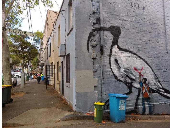
Figure 6: Bin chicken mural, Darlinghurst.