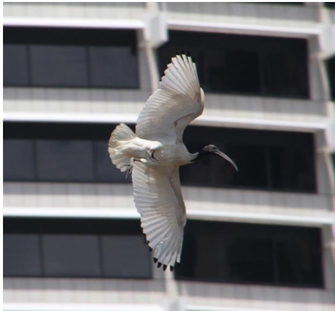
Figure 1: Australian White Ibis in flight (Sydney, 2016).