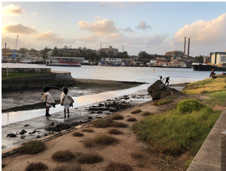
Image 5. Ibis photo shoot, Glebe, Sydney Harbour, 2019.

How do we read the centrality of the Ibis in this shrine? Perhaps, rather like the Virgen de Guadalupe and the Catholic Saints referenced in shrines in Mexico and other Latin American countries, the Ibis here is at once a patron saint and an animal totem, an emblem of quotidian, often disparaged ordinariness. Ironically, the inclusion of the Ibis as the visual centrepiece to the altar is anachronistic: the Ibis was rare in urban locations along the eastern seaboard in the 1970s, and was only beginning to migrate to Sydney in that decade. Nonetheless, the Ibis in this altar looms large over a denigrated cultural history of Australiana. It is not surprising that Ibis kitsch has flourished as an aesthetic with which to mediate and represent the presence of Ibis in Australia's largest city.