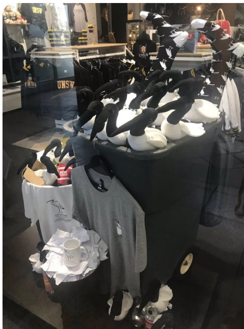
Figure 7: 'Official-Unofficial' Ibis paraphernalia, UNSW, 2019.

There are dozens of murals featuring Ibis across Australia's cities, a large number occurring in Sydney in suburbs such as the famous Bondi, in places such as Sydney University and North Sydney, and in inner city suburbs such as Alexandria, Waterloo, and in this case, Darlinghurst. One of the keys to the aesthetic success of these murals is how neatly they integrate with and speak to the surrounding streetscapes, particularly in relation to the bins that Ibis are notorious for feeding from. This roughly rendered bin chicken by the well-known Sydney muralist Lister now coexists with the bins belonging to the terrace home on which it is painted.