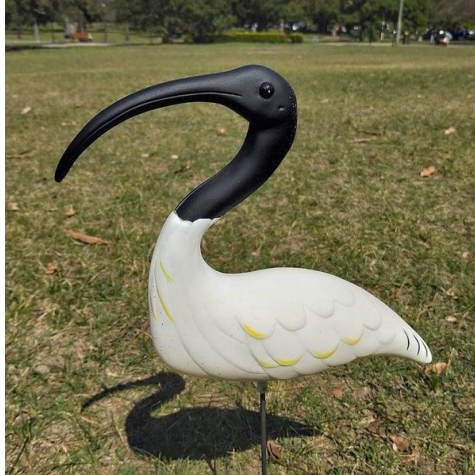
Figure 3. 'Old Mate the Ibis, proper kitsch for a sunburnt country.'

As an aesthetic category that originated in 19 th century Germany, where it referred to mass-produced replicas of expensive goods, and to artistic representations meant to evoke sentimental affect, kitsch has attracted a great deal of critical attention, much of it disdainful. For many modernist critics, kitsch was the antithesis of high art, and of authenticity. For some of those critics, kitsch was yoked to the regalia and symbolism of Nazism, Fascism and Stalinism (Broch, 1969, 2002; Greenberg, 1961; Rosenberg, 1962; Friedländer, 1984). Matei Calinescu, however, regards kitsch as a misunderstood characteristic of modernity itself, and argues that dismissals of kitsch have been formulated in denial of its history as 'one of the most bewildering and elusive categories of modern aesthetics' (1987: 232). Despite that conceptual elusiveness, anti-kitsch sentiment continues to be elaborated, one example being The New Aesthetics of Deculturation: Neoliberalism, Fundamentalism and Kitsch , by the German philosopher Thornsten Botz-Bornstein (2019). This text is notable for Botz-Bornstein's conflation of deculturation (cultural loss and destruction) with a 'vulgar' kitsch sensibility that he claims is akin to 'aesthetic fundamentalism' and responsible for such phenomena as the rise of 'selfie' culture and of the sorts of 'fake news' popularized under the US Trump administration. 8