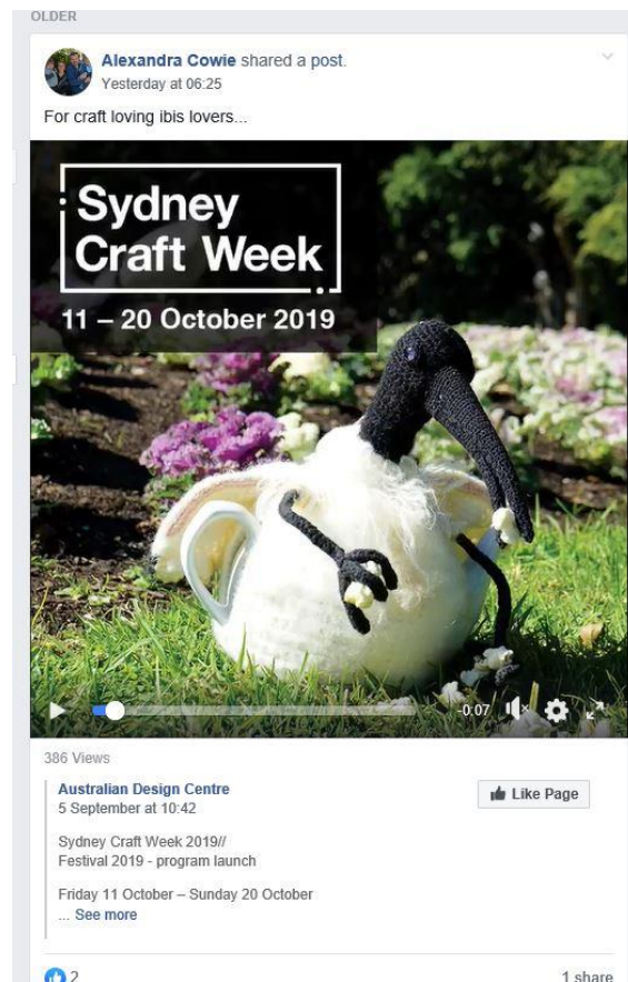
Figure 8: Bin chicken tea cosy, Sydney Craft Week, 2019.

In early 2019, to note a salient example of the rise in cultural and arguably class status of bogan-ibis, the Sydney-based University of New South Wales (UNSW Sydney) introduced a set of ‘Official-Unofficial’ Ibis paraphernalia, including plush toys, mugs, socks and t-shirts, for purchase as mementos on graduation days. Ibis are a notable presence on all campuses of the universities based in Sydney, as well as a good number of TAFE colleges. But UNSW clearly adjudged the Ibis cultural zeitgeist as a playful, but always already profitable opportunity for marketing and merchandising the university itself. Here, however, an aesthetic transformation of Ibis kitsch is evident; no longer implicitly evoking a bogan stickiness, the memorabilia for sale here have been, so to speak, de-boganized. The resulting products remain kitsch, but in forms that are soft, cute, cuddly, fun, and ultimately unthreatening. This de-boganized aesthetic shift might be explained by the fact that the main purchasing constituency for these ‘Official-Unofficial’ products are international, fee-paying students, who comprise a sizeable population within Sydney.