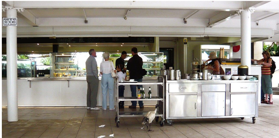
Figure 2: An Australian White Ibis in the restaurant of the Royal Botanic Gardens (Sydney, 2009).