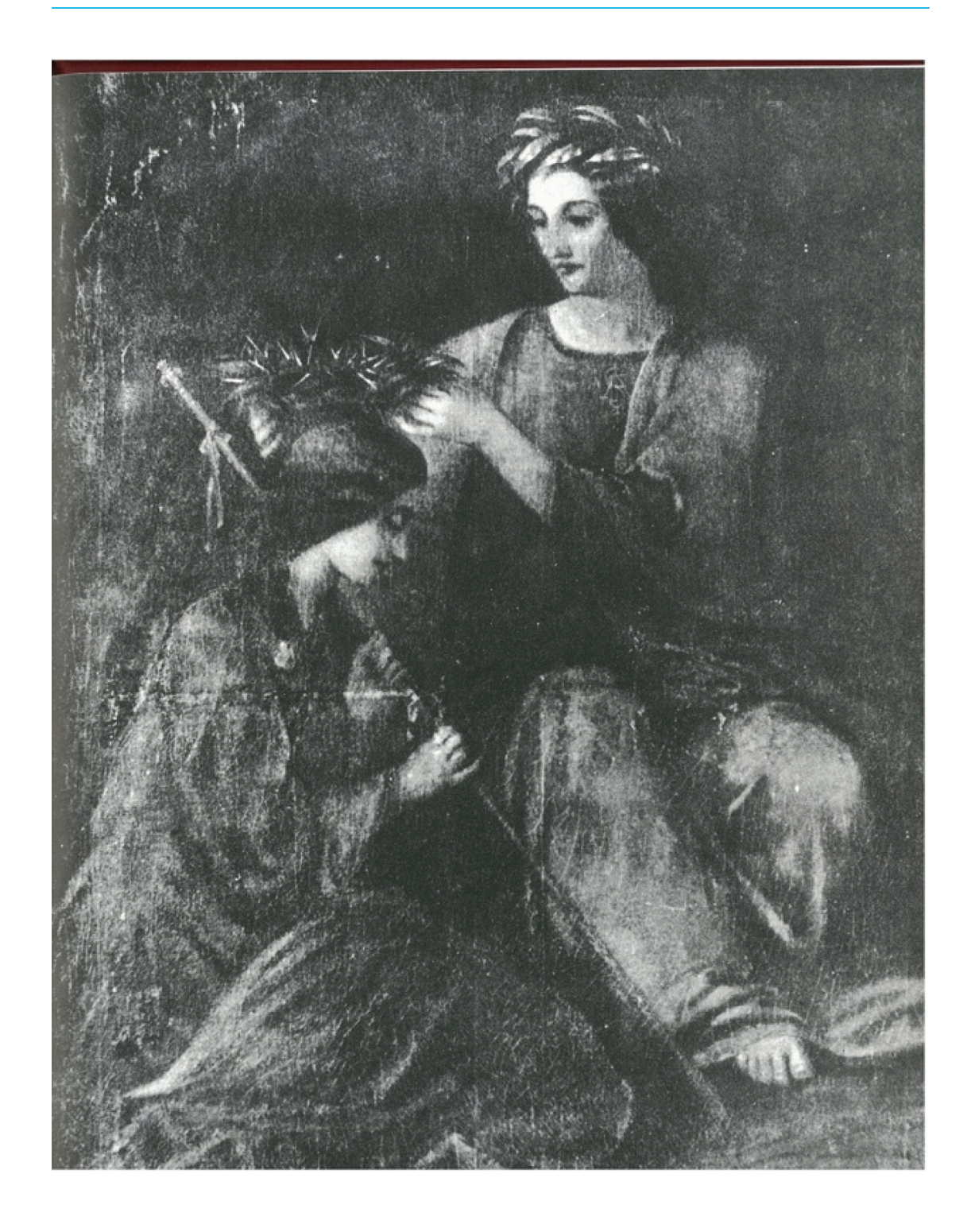
Figure 2: Adelaide Ironside, 'Ars Longa, Vita Brevis: The Pilgrim of Art Crowned by the Genius of Art' (1859).

Look about their apartment now, in the few days before Martha leaves. In the next room, she has begun packing their trunk. It stands open, half full of sketchbooks, poetry and papers.<sup>20</sup> Much of Adelaide's art is already packed, or at least covered in cloth. Indeed, the only work Martha