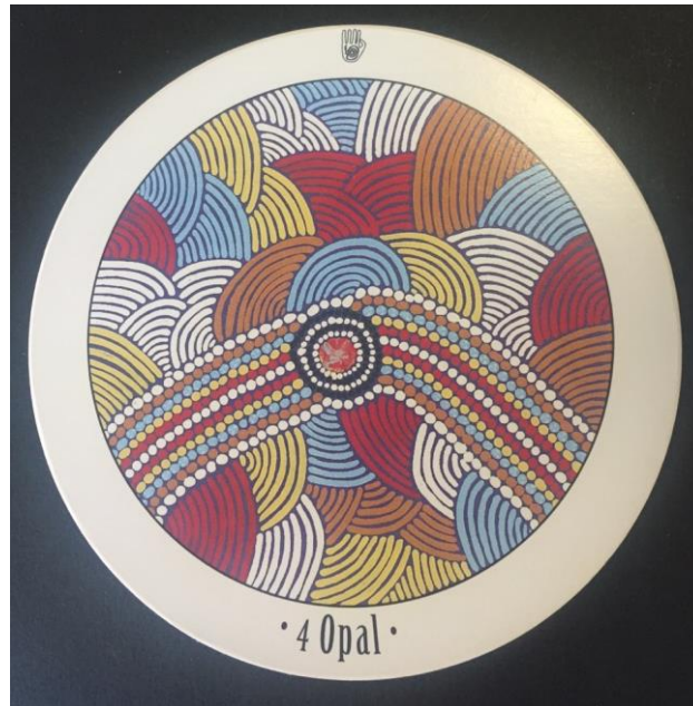
Figure 2. Rosa's imaginal product for the imaginal appropriation moment