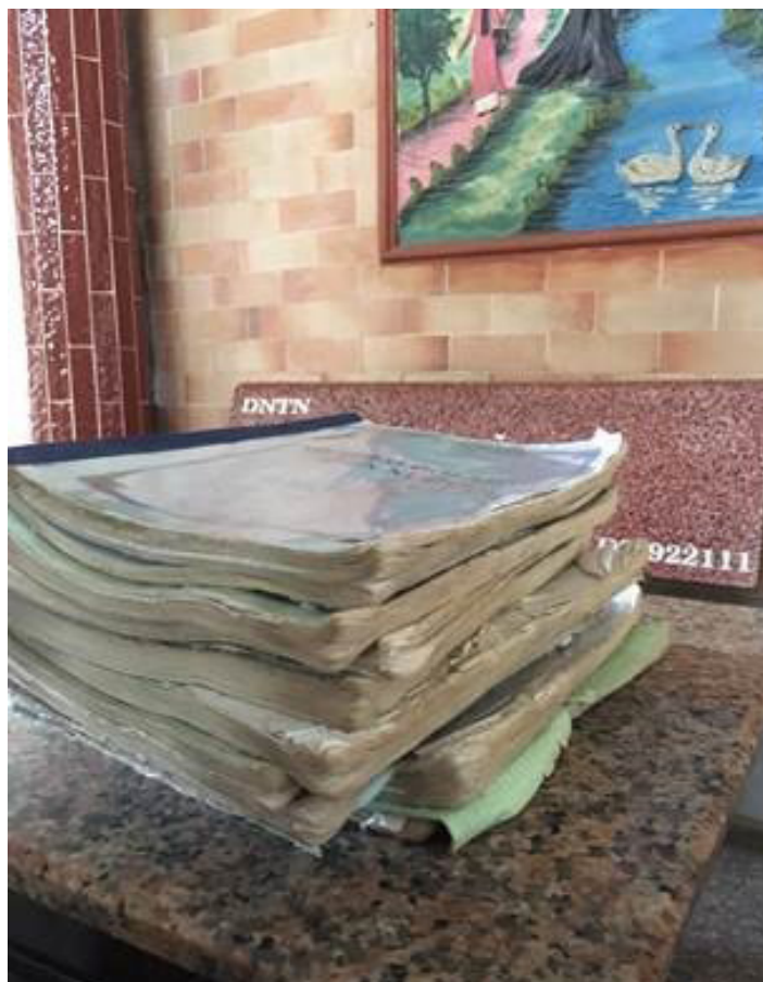
Image: Private water enterprise documentation on financial flows.