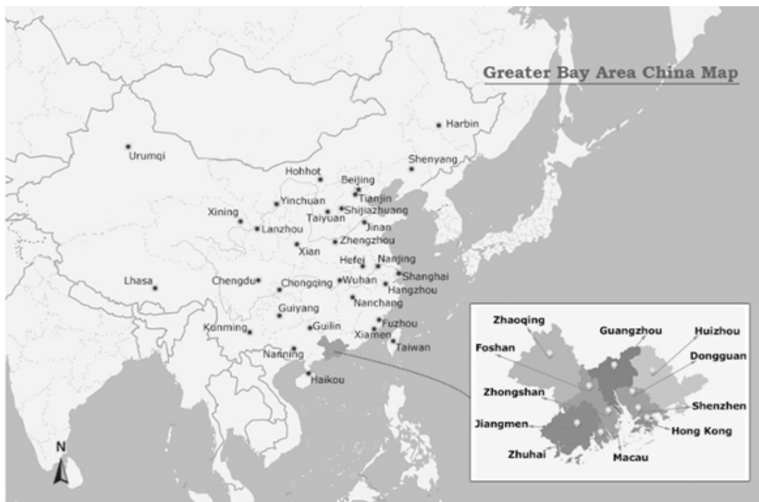
Figure 1: Location of the Greater Bay Area China Map