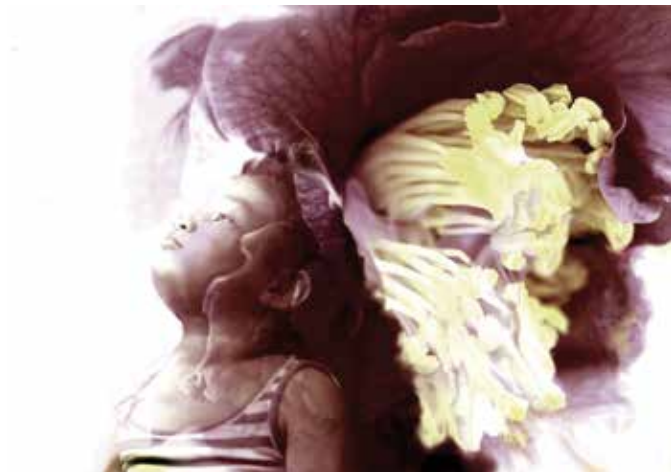
SUZETTE COROUDIER "The Blossom of Hope" Digital Imaging