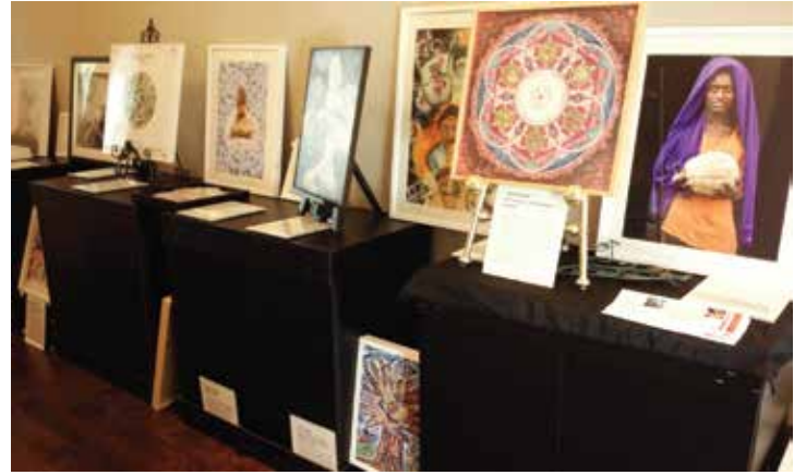
The Woodlands, 2014