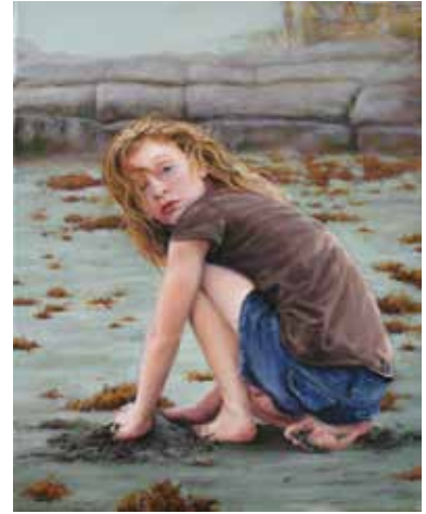
BARRY CARTER "Phantasy" Oil Painting