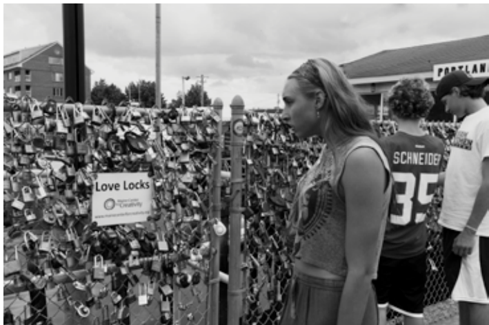
PAMELA Z. DAUM "The Love Locks" Black and White Photography