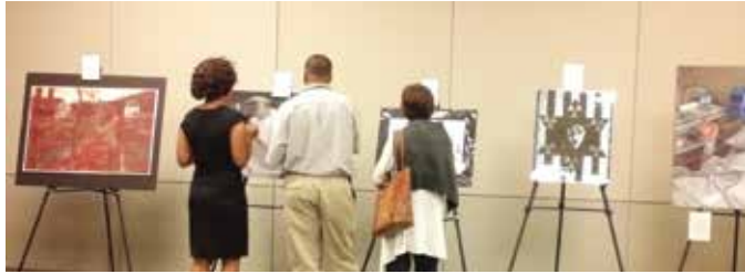
M.D. Anderson Cancer Center, 2014