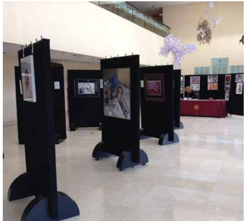
Mexico City, 2015