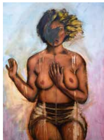
JOE PENA "A Mother's Lament" Oil on Canvas