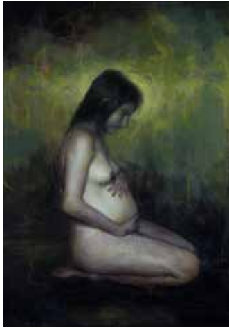
LUCA CRIVELLO "Conflitto" Oil on Wood Pane