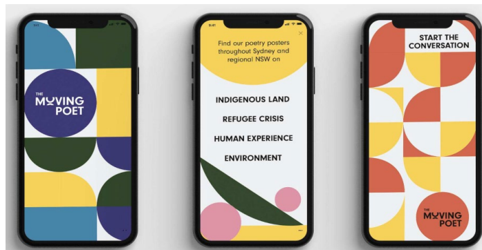
Figure 3. Instagram mock-up

Social media is an ideal medium for the potential spreading of the WoW Project and The Moving Poet, to reach further and deeper into the community at an intuitive and organic pace (see Figure 3).