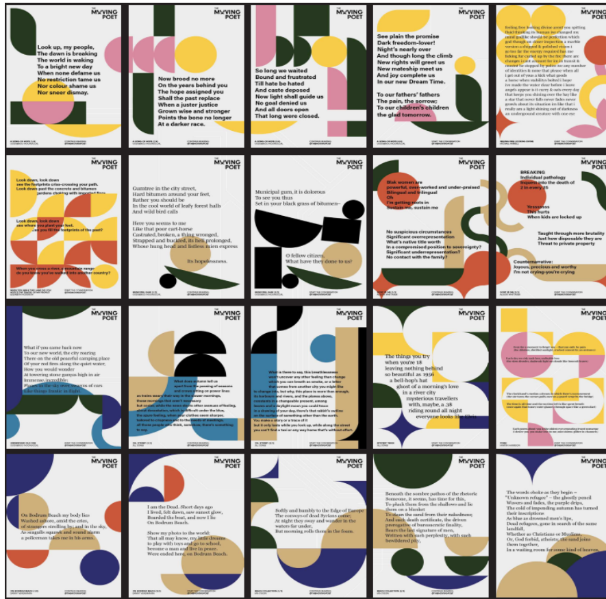
Figure 2. The posters

Social media is an ideal medium for the potential spreading of the WoW Project and The Moving Poet, to reach further and deeper into the community at an intuitive and organic pace (see Figure 3).