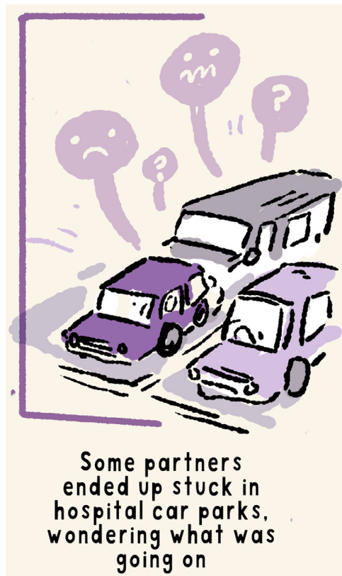
Fig. 3. Artistic depiction of findings – birth partners

However, restrictions were often viewed as arbitrary and, therefore, changes to birth plans, including presence of birth partners, were frequently reported as unnecessarily frustrating: