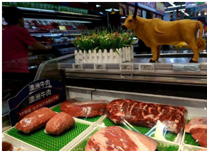
Australian beef sold in a Chinese supermarket

The political relationship between Australia and China took a battering in 2020, with Australia targeted by Beijing for a series of 'geoeconomic punishments' 34 (see Chapter 9, 'Economic Power and Vulnerability in Sino-Australian Relations', pp.259–274). Yet Australian trade with China showed resilience in aggregate. China accounted for 38.2 percent of Australia's goods exports in 2019. 35 By the end of 2020, this share had risen to 40.0 percent, while the total value was