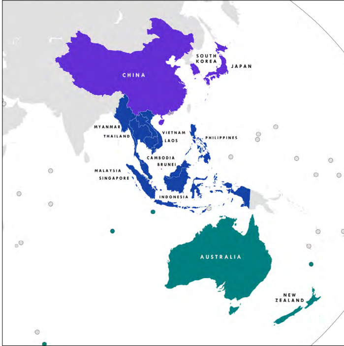
Regional Comprehensive Economic Partnership (RCEP)