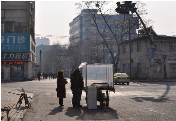
Premier Li's declared that street vendors represented the 'livelihood of China'

How did China manage to perform so well while the global economy was crumbling? Emergency government interventions played a big role initially. The most prominent of these was the RMB 3.6 trillion (US$500 billion) fiscal stimulus announced in May — the equivalent of 4.5 percent of Chinese GDP — taking the country's budget deficit to 3.6 percent of GDP, above the longstanding ceiling of 3 percent. 11 The stimulus followed the familiar playbook of primarily targeting investment in infrastructure (as discussed in Chapter 5, 'China's Post-COVID-19 Stimulus: Dark Clouds, Green Lining', pp.139–153) and property development, while Chinese households by and large received no direct support. This was evident in China's second quarter GDP growth rate of 3.2 percent (year-on-year), to which investment added 5 percent while consumption subtracted 2.3 percent. 12