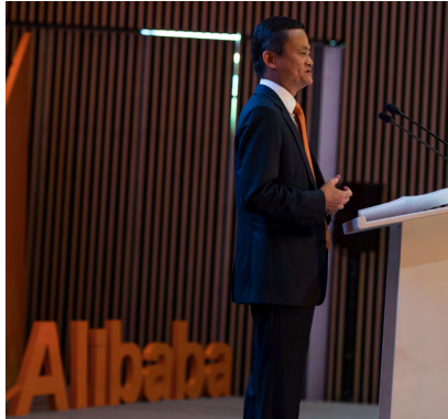
China’s richest man, Jack Ma

Dreams , Forum, ‘Xi Jinping’s War on “Black and Evil”’, pp.37–41.) A case in point is China’s richest man, Jack Ma 马云, who was worth US$61.1 billion in mid-November 2020 according to Forbes ’s ‘real-time billionaire’ list. 20 Ma, a longstanding member of the Communist Party, co-founder and former executive chairman of Alibaba and owner of its affiliate Ant Group, the world’s highest-valued fintech company, was also