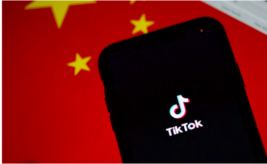
TikTok would face a complete ban if it did not sell to a US company by 14 November

Retaliation by Beijing also saw the average tariff rate on US imports climb to 25.9 percent by the beginning of 2020, up from 8.0 percent two years earlier; at the same time, China was cutting tariffs on imports from other countries. 25