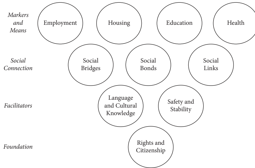
FIGURE 1: Conceptual framework defining core domains of integration. Reproduced with permission Ager and Strang [21].

development of the interview guide questions to tap into the key areas to elicit information from participants. Although questions were designed to elicit particular information from participants, they were kept flexible to allow for the investigation of interesting and similar information on the issue being explored. Also, there were probing questions for further elucidation into the areas of investigation. The interview guide explored how participants identified themselves in Australia, what makes them identify themselves the way they did, their experiences of settling in Australia, changes in their experiences over time, social and general life situation in Australia, the perceptions of South Sudanese people in Australia, and how they saw themselves and that of the general South Sudanese community in Australia.