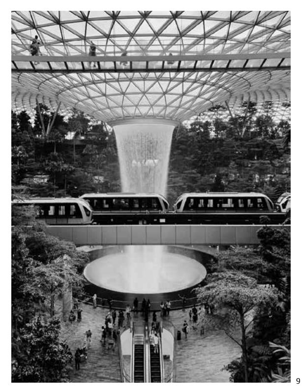
8 Internal view of the conservatory at Gardens by the Bay.