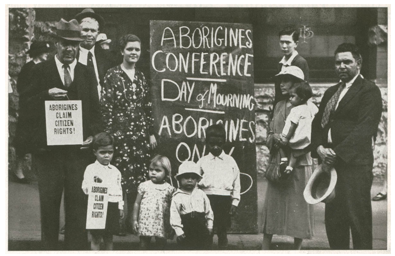
Figure 2 : "Aborigines day of mourning, 26 January 1938," Q 059/9 Mitchell Library (Printed Books Collection).]<sup>40</sup>

From the 1930s, there was a marked rise in organised Aboriginal political activity in south-eastern Australia. This included the formation of the Aborigines Progressive Association and the Australian Aborigines League, marked by key protests such as the Day of Mourning in Sydney in 1938 and the Cummeragunja Walk-Off in 1939. Leaders such as Bill Ferguson and William Cooper drew on a range of broader political discourses of rights to campaign for land rights, political representation, and the vote. Cooper's protest against the Nazi government of Germany was likely intended to also draw attention to the persecution of Aboriginal people by Australian governments.<sup>37</sup> In the post-war era, as the atrocities of the Holocaust contributed to growing awareness in Western societies of the dangers of racial discrimination, Australian governments and society became increasingly uncomfortable about the position and treatment of Indigenous people. While there were some moves to extend greater citizenship rights to Indigenous people, increasing unfavourable international interest in the rights of Indigenous people contributed to state and federal-level debates over citizenship rights, including the vote.<sup>38</sup> At the same time, a policy shift occurred—at different times in different states—towards the cultural and economic assimilation of Indigenous people.39