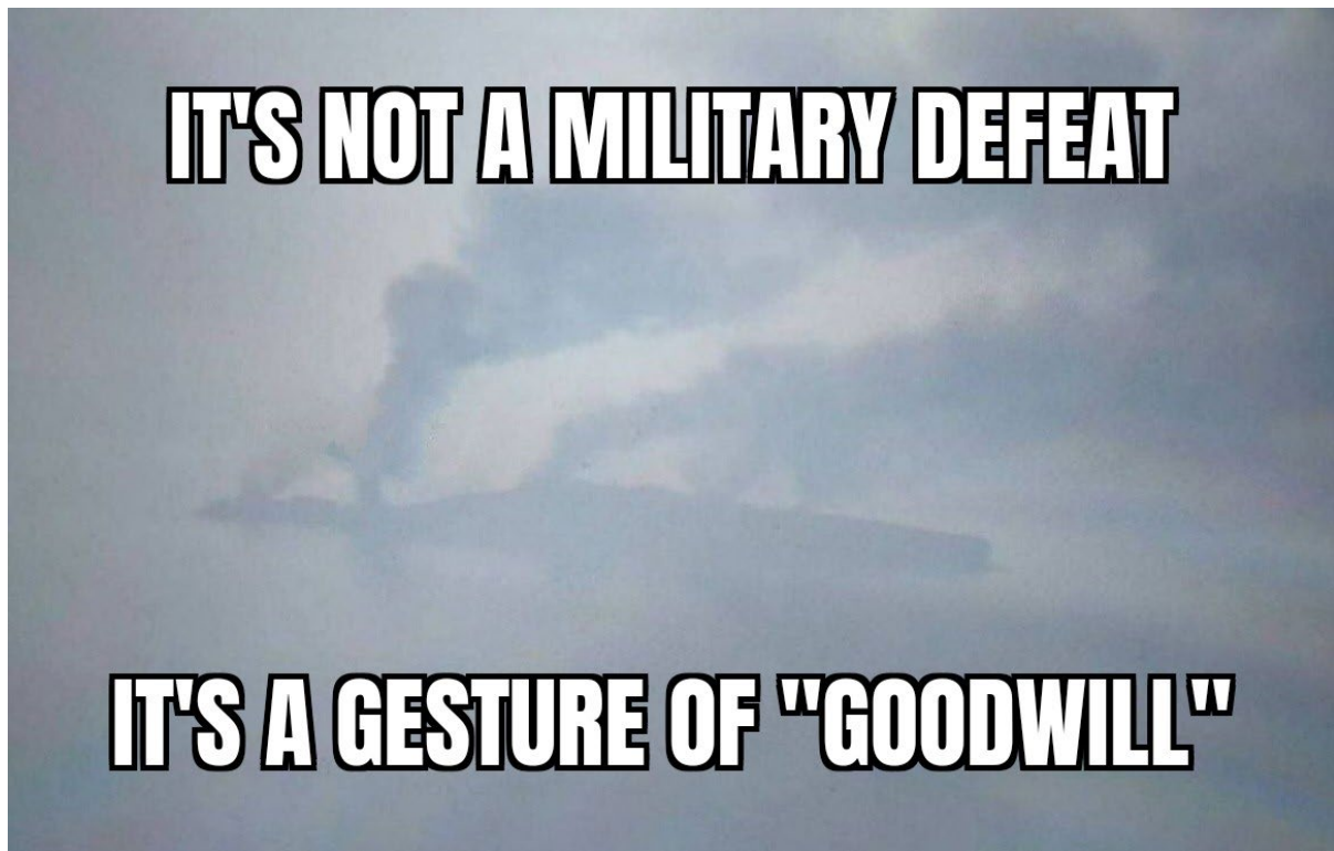
FIGURE 5. UMF meme May 30.

TASS's awareness of likely cynicism over their announcement of the withdrawal as a goodwill gesture was manifest in a press release after the withdrawal that attempted to diminish the Ukraine's recapture of the island: