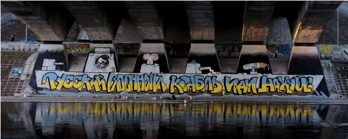
FIGURE 3. Snake Island-themed graffiti under a bridge in the Latvian capital of Vilnius (Dubra, 2022).

Furthering the promotion of the ZOM episode, on March 1, Ukrposhta, the Ukrainian postal service, launched a competition for designs for a stamp to commemorate Hrybov's response and the overall incident. 496 designs were submitted before the March 4 deadline, with a shortlist of twenty being compiled before an online vote was conducted (Dennett 2022). The winner was announced on March 8: Boris Groh's (David-and-Goliath like) image of a Ukrainian soldier raising an index finger to a Russian warship (fig. 4). 10 The final design and its commemoration on a Ukrainian stamp became a substantial media story in its own right, further elevating the profile of the ZOM episode, and being complemented by international media coverage of the demand for the stamp in the Ukraine (e.g., SBS News April 19) and in President Zelenskiy's promotion of the stamp on social media. The organisation of the design competition for a commemorative stamp and the printing of around one million copies (Cheng 2022) during an invasion and a concentrated attack on Kyiv merits comment here. The effort required to prioritise this project over other essential services indicates the faith that the Ukrainian Government had in the ZOM meme and in the marketability of products perpetuating it. National and international interest in the stamp was also marked and attracted news coverage in its own right (SBS News 2022, Tsoni 2022), and sales of the stamp directed useful funds into government coffers.