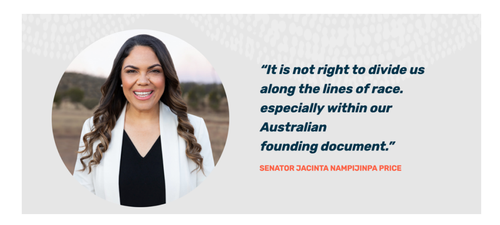
Screenshot: Fair/Advance Australia<sup>7</sup>

On the same day as the defeated Voice referendum in Australia, a national election was held in Aotearoa/New Zealand. With the recent change of government to the right in New Zealand, the radical right wing National coalition partner the ACT party, led by David Seymour, is now running a carbon copy campaign to try and bring about a referendum on Māori co-governance and the long settled constitutional recognition of the 1840 Treaty of Waitangi, citing polling by the Atlas thinktank New Zealand Taxpayers Union.<sup>5</sup> ACT's election campaign slogan "End division by race" will sound very familiar to Australians.<sup>6</sup> Of course there was no mention of 'race' in the proposals of the 2017 National Constitutional Convention, the Uluru Statement for the Heart, or the constitutional discourse on the Treaty of Waitangi. The term was surely deliberately introduced by Atlas thinktanks precisely to foster and license racial discourse (e.g., to encourage racism), the better to 'divide us on the basis of race'.