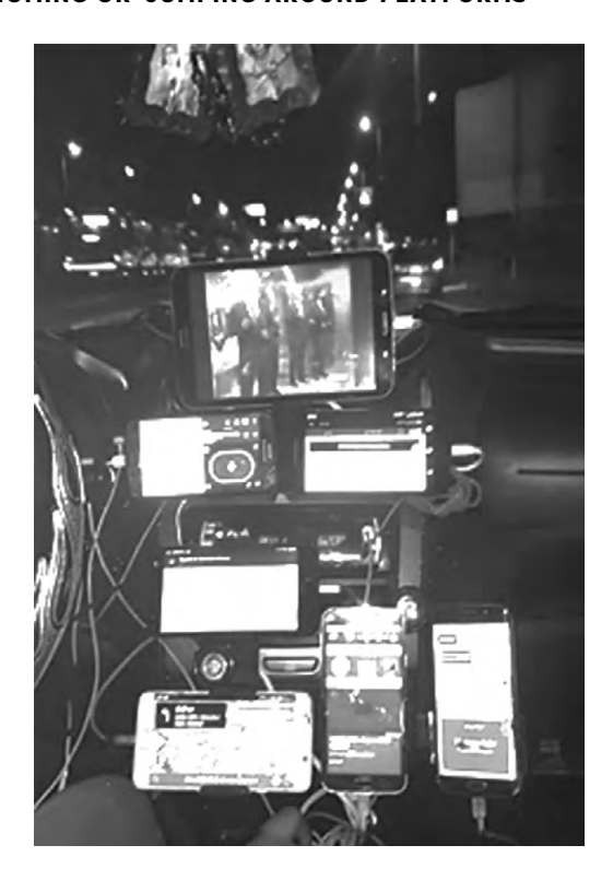
FIGURE 2. MULTIHOMING OR 'JUMPING AROUND PLATFORMS'