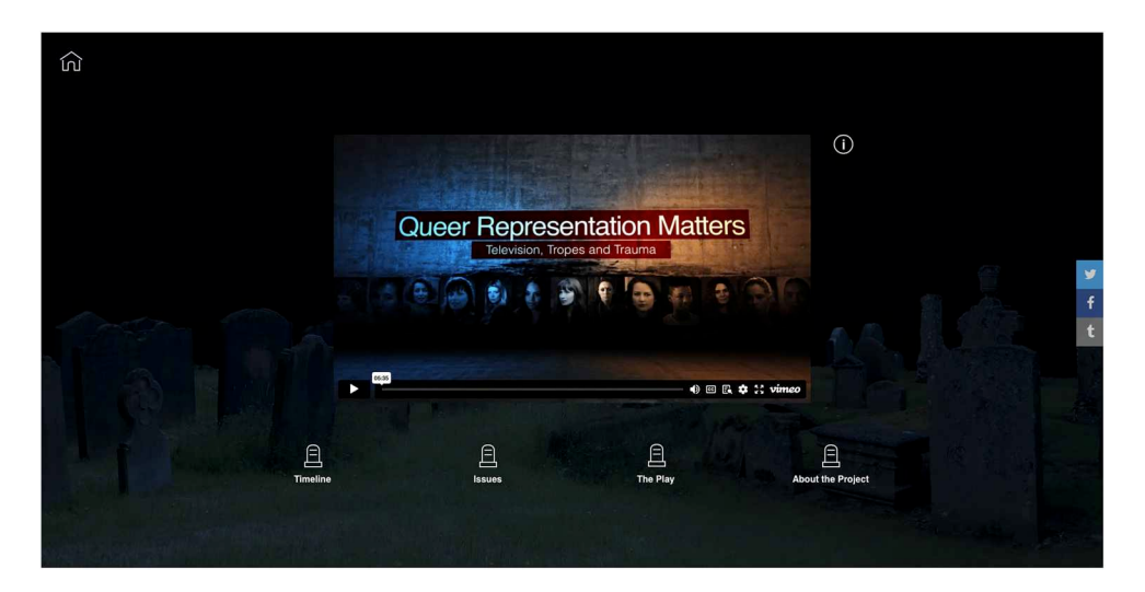
Figure 1. Home page of Queer Representation Matters showing the four main content areas (Krikowa 2023).

Users can choose which path they take, in whatever order they desire, but they will always return to the core 'Home' page. The i-doc's 'narrative of sorts' can be navigated and experienced according to the viewer's individual engagement with the hypertext and