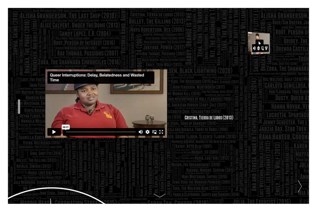
Figure 3. Screenshot of Queer Interruptions showing the non-linear layout of the videos (Aguas 2021)

Rose 2013, 370). For example, each of the five videos could have been split into several shorter videos, but the non-linear navigation meant that they would not have been viewed in the intended order. Rather than viewers enjoying 'random access' (Odorico 2020, 96), the degree to which viewers co-produce meaning is negotiated with the need to present the videos with narrative linearity.