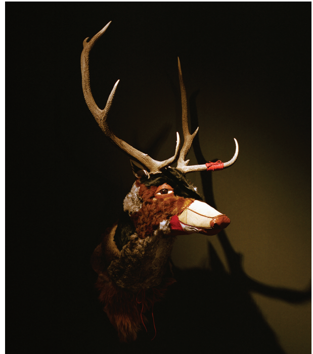
Figure 4. Beata Batorowicz Stag mending ritual (2018).

From the Dark Rituals. Magical Rituals Fur, leather, Stag antlers. 110.0 × 135.0 × 76.0 cm.