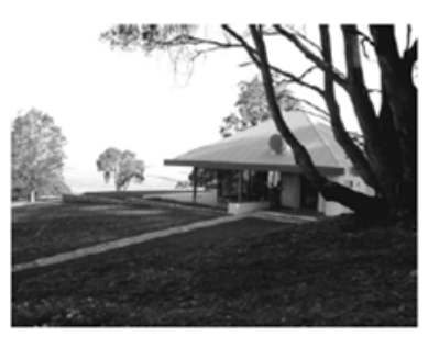
Figure 5: La Casa di Campagna

afternoon when the weather can change into a summer storm is the ideal moment to appreciate the relation of the house, this squared room, to its landscape. Strolling over rocks, barks, leaves, through ghost gums and over brownish earth, dark red, olive green, over the dryness of branches and moving between the vertical slender of white gum trees the only sound one often hears is the dry sound of steps over broken bits of dry leaves and sticks—the still landscape before the tempest. Within this zone of apparently limitless nothingness, nothing moves, or appears not to move without an apparent sign of anything having the authority to break the stillness. The only interruption is the cold metal of the water tank which creates a reassuring presence of water inside. The house from the hill exposes a perfect square—a squared stainless steel roof affected by the light and play of the colors of nature as the often mutant sky, grass and leaves reflect on to the metal roof.