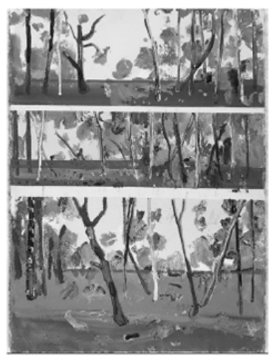
Figure 7: Fred Williams, 1970 Rectangular Guaches of Bega

Overall, the notion of a changing natural context reminds us of the Greek philosopher Heraclitus' doctrine of the 'flux and fire', which describes the view that nothing in the world is permanent or fixed or the same at different moments.<sup>7</sup> Yet, Giurgola's la casa in campagna at Lake Bathurst seems rather to embrace Plato's view that within the flux of ever changing elements a form does not change but endures with an undying and timeless perfection.<sup>8</sup> In this regard Guirgola's architecture reflects the spirit of Plato's timeless perfect geometrical form of the square in contradistinction to the ever-changing flux of the atmospheric conditions of the site during the day and over the seasons. Giurgola argues " I greci dicevano cose che sono ancora valide ". (The Greeks used to say things, which are still valid.)<sup>9</sup> Through this architecture, Giurgola validates the spirit of ancient Greek philosophy making universal ideas related to human nature and its relation to the natural and built environment. From inside the house, one can sense the multiple impressions of the land and its relation with the architectural space through the rectangular frames of the openings.