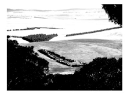
Figure 6: Lake Bathurst

Due to this, the following questions are raised,—to what extent did the natural environment of the whole place including the wind and sun make that architecture possible? And from this, where should we be to initiate the discourse? Should we begin from the geometric shape of the square or from the small perimeter rooms with their low ceilings, which are enhanced by high framed views of the top of trees, bush, or from the double height living space overlooking the reminiscence of the lake now dry and empty?