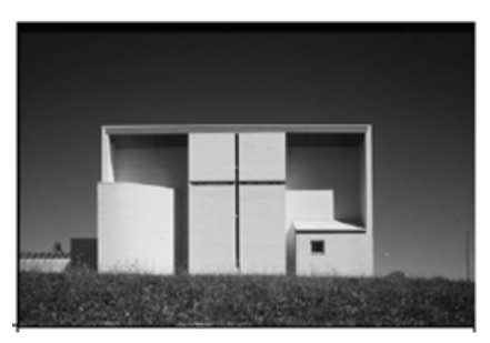
Figure 9: St Thomas Aquinas Charnwood 1990