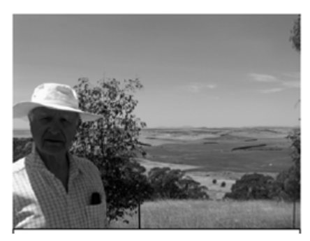
Figure 1: Romaldo Giurgola 2006