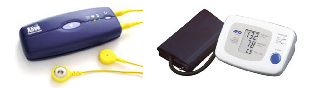
Figure 2: Alive ECG/Accelerometer monitor (left) and A&D Medical Blood Pressure Monitor (right)

We also use a Bluetooth enabled Blood Pressure Monitor and Scale from A&D Medical [1]. High blood pressure is another important risk factor for developing cardiovascular diseases [3] and regular monitoring is essential. Also being overweight or obese can also contribute to developing cardiovascular diseases and for some heart patients monitoring the weight is important.