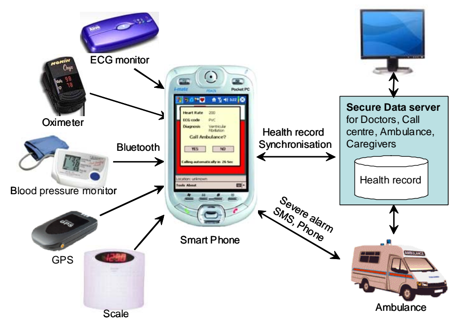
Figure 1 - Personalized Heart patient monitoring architecture

incorporate the best sensors as they appear on the market. The sensors we use are Bluetooth enabled or integrated into the smart phone (e.g. GPS). The smart phone processes the sensor data and monitors the patient's wellbeing, and in case of an emergency, it automatically calls an ambulance to the location of the patient. It can also warn caregivers or family members via SMS or phone when the patient is in difficulty.