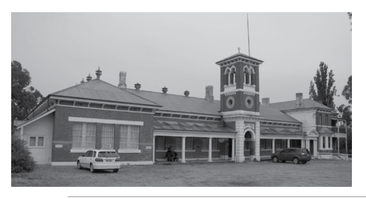
Figure 4: Young Public School designed in 1883 in the "Grand Classic Style."