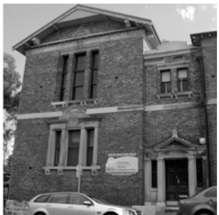
Figure 3. Two schools in the "Simple Classic Style." (L) Waterloo (R) Australia Street.