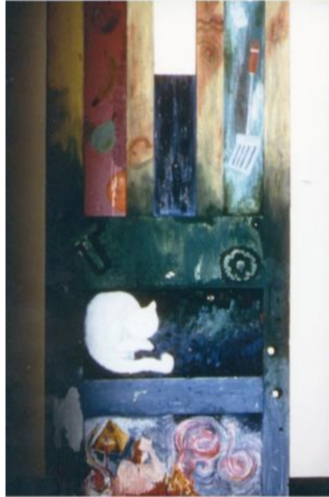
Figure 2. Group project of carved and painted door, Youth Arts Archive 1988-89.

Colin had grabbed the door off the top of a skip full of rubbish on the pavement of a dirty inner city street, together with a curved metal chair. Presumably it had come out of a house that was being demolished, and he had brought it into the youth center across the road from the (supposedly) sterile hospital precinct. The paneled door was carved and painted in acrylics by a small group of young people collaborating with Colin. They painted the upper part with domestic objects from everyday life, perhaps things that young people in hospital missed from home—fresh fruit, and their pet cat placed in pride of place in the middle. The egg slice might be a reminder of ordinary domestic life, making your own breakfast, far from the hospitalized lives of the young painters.