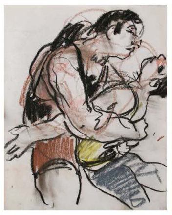
SHARPE, Wendy Embrace (dencers in rehearsals) 1997 charcoal and pastel on paper

Please note: previous works by the contemporary artists illustrated as indication of the type of works currently being created for Creative Australia and the Ballets Russes