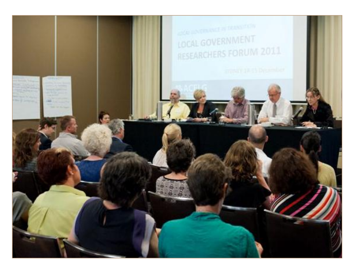
Plenary session of the 2011 researchers Forum