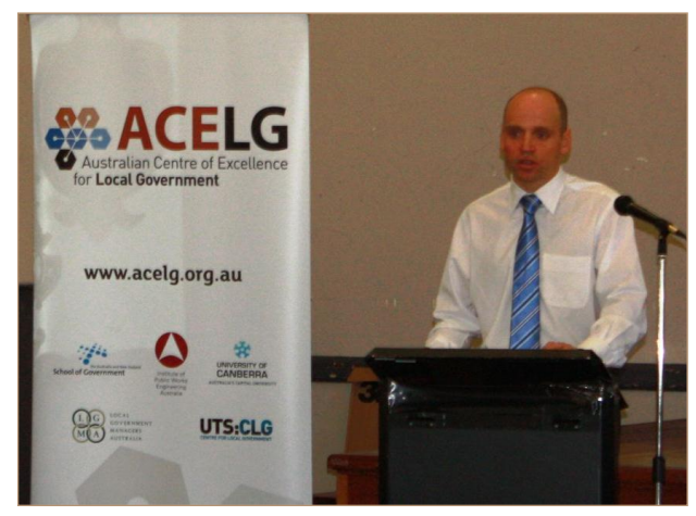
Minister Mark Arbib addresses delegates at the roundtable

The roundtable brought together around 50 key representatives from local government, federal and state government and Indigenous employment sectors, and was an important contribution to the National Local Government ATSI Employment Strategy.