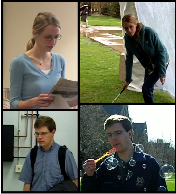
Fig. 1. Clips of two people sampled from four PaSC handheld videos: files 06599d91.mp4, 06599d451.mp4, 05450d1359.mp4 and 05450d1759.mp4.

sensors used to acquire videos, and properties of the subjects such as gender and race. The dominant factor influencing performance is the combination of locations, actions and sensors, indicating verification rates more than double when going from the most to the least challenging environments.