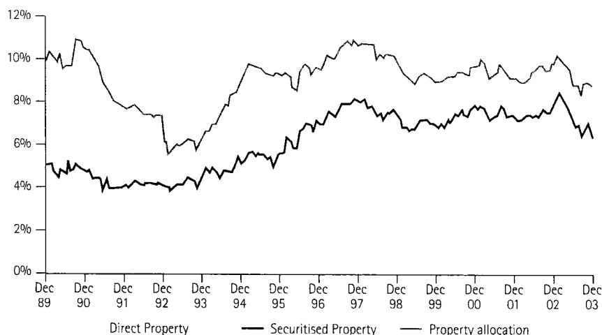
Figure 1: Average Australian Balanced Fund Allocation to Property

Formal modelling and forecasting for direct property has developed over the last 25 years and is now an essential part of the commer-