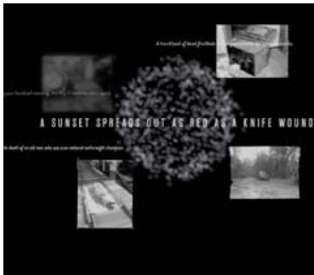
Figure 3. Flock, images and text

camera mounted above the top of the screens in the centre of the room and pointed vertically downward. Because Bystander needs to be installed in a range of gallery and museum environments, all computing hardware is of fairly standard commodity specifications.