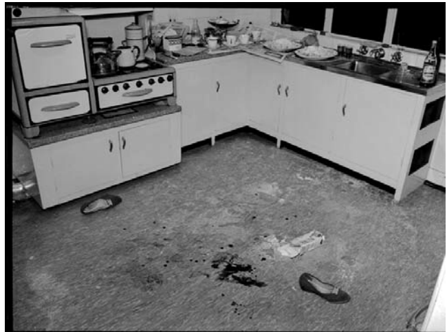
Figure 1. Miller St

other collections in museum and gallery environments. Bystander is a prototype for how such an exhibition environment might be used and is intended to function as a test-bed that supports a number of future investigations into how different aspects of such spaces are experienced.