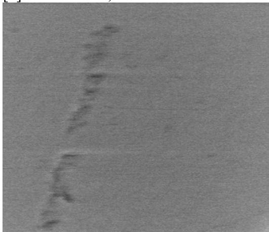
Fig. 1. TV rate SE image of an uncoated sapphire specimen using the induced anode current with the grid grounded and the stage at 0 V, anode bias = 550 V, pixel dwell time = 100 ns, working distance = 13 mm, grid position = 5 mm below the anode, Accelerating voltage = 30 kV, water vapor pressure = 1 Torr. Horizontal width of field = 150 \mu\text{m}